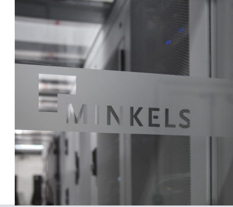
The Minkels Cold Corridor ensures and optimises data centre cooling while taking the heat generated by the servers into account.