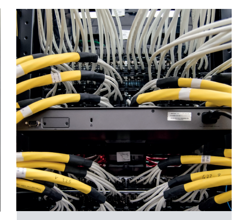
LCS<sup>2</sup> cable solutions by Legrand, both optical fibre and copper cables (Cat. 6A).